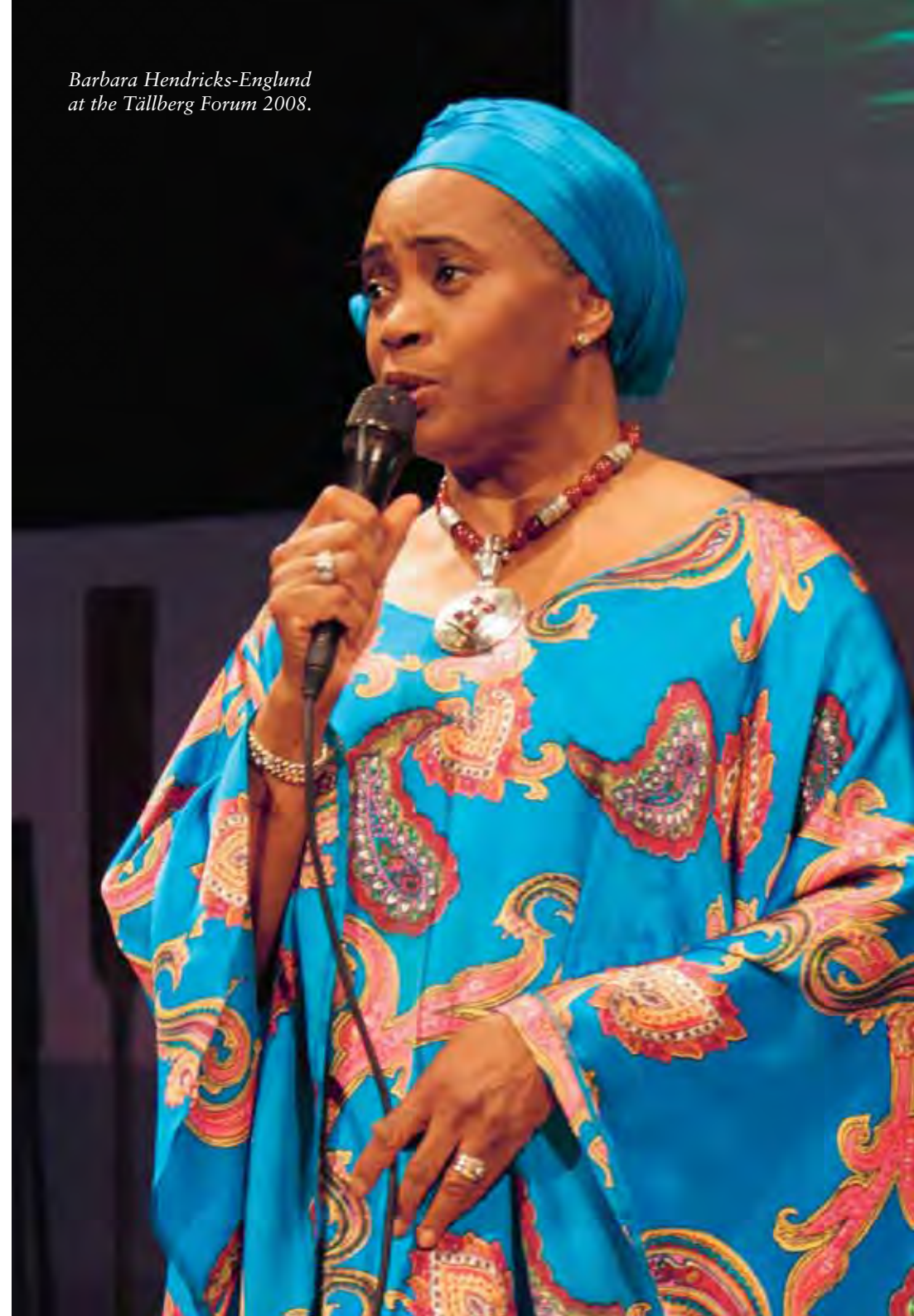
Barbara Hendricks-Englund at the Tällberg Forum 2008.