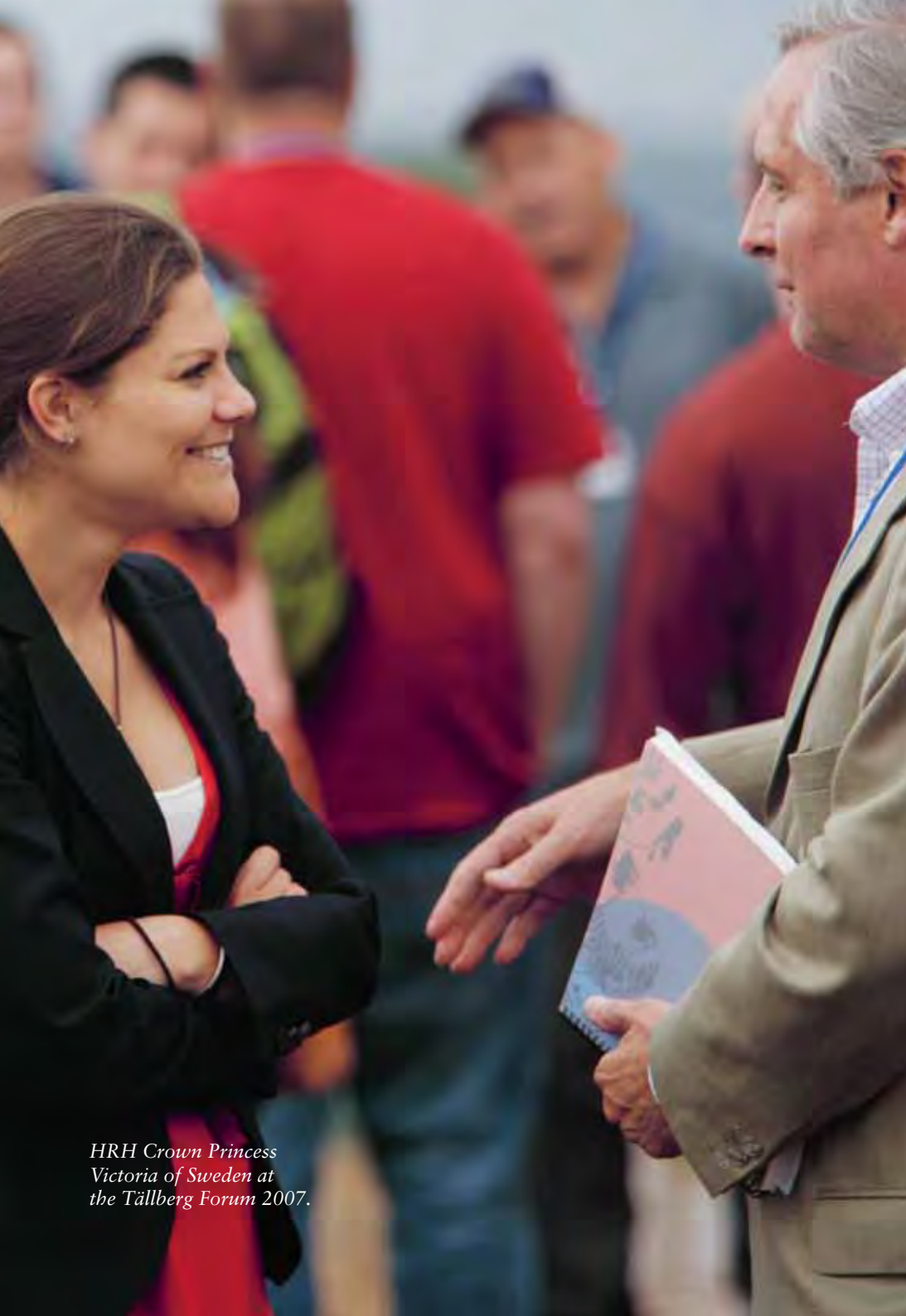
HRH Crown Princess Victoria of Sweden at the Tällberg Forum 2007.

The Tällberg Foundation has over the last ten years built a highly skilful and effective staff, presently with 15 people. A new generation of leadership is assuming the management and responsibility for the future of the Foundation. The turnover of the Foundation has grown from 2 MSEK in 2001 to 33 MSEK in 2010. The equity of the Foundation is expected to amount to 1 MSEK by year end 2010.