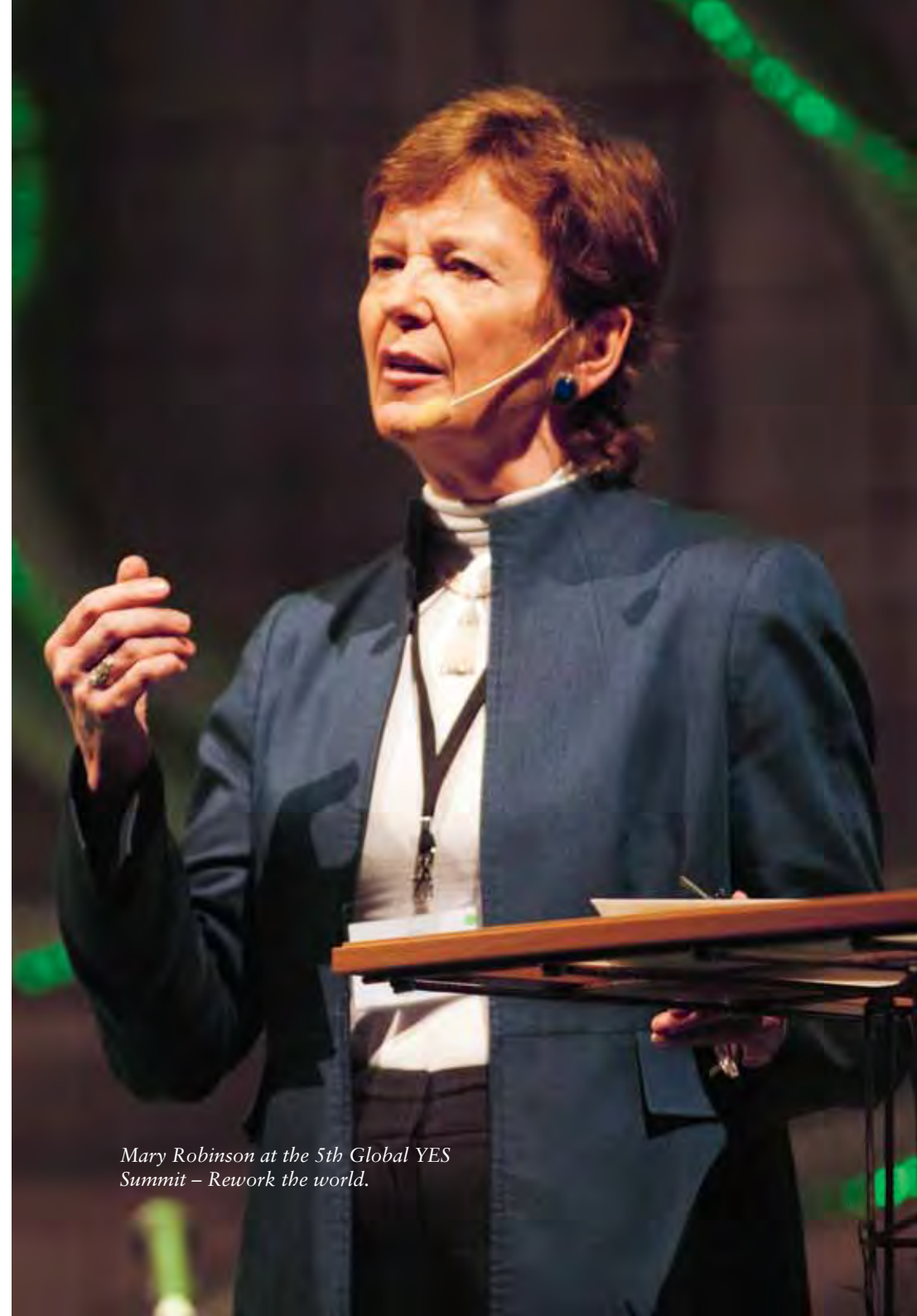
Mary Robinson at the 5th Global YES Summit – Rework the world.

350 ppm CO 2 is the safe limit for atmospheric concentration of carbon dioxide, according to James Hansen. In 2008 the worldwide average level stood at 385, up 2.2 ppm from last year. Today it is 391 ppm.