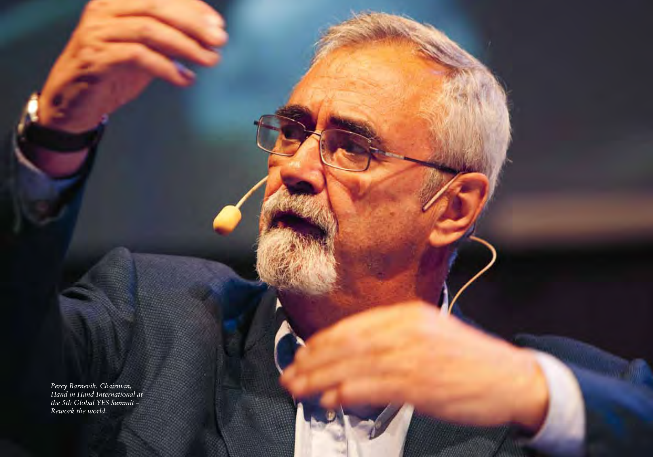
Percy Barnevik, Chairman, Hand in Hand International at the 5th Global YES Summit – Rework the world.